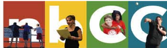
Northern Berkshire Community Coalition